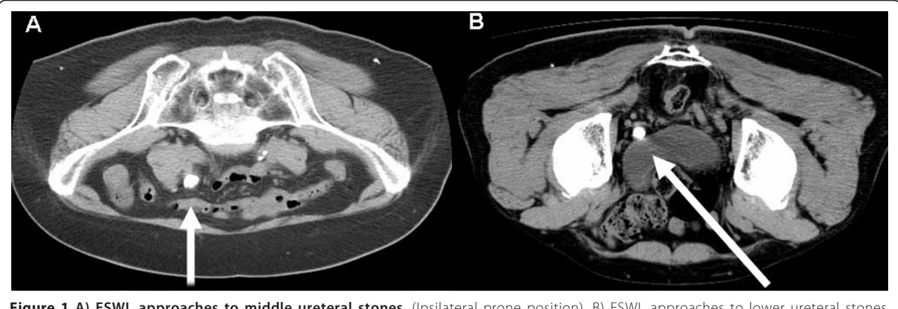
Figure 1 A) ESWL approaches to middle ureteral stones. (Ipsilateral prone position). B) ESWL approaches to lower ureteral stones. (Contralateral prone position)

most frequent (68 cases), followed by mixed calcium oxalate and calcium phosphate stones (49 cases), and stones containing calcium were present in 126 cases.