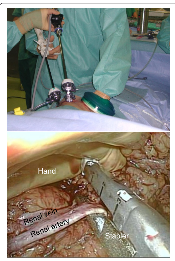
Figure 2 In the control of renal vesels, the kidney was retracted by hand-assist to facilitate the access to the renal vessels. Hand-assist through GelPort also enabled the rapid extraction of the graft.

Perioperative outcomes were summarized in Table 2. The mean operation time was 242.2 \pm 37.0 (range: 214.0 - 409.0) min; it included waiting time for differently-timed recipient preparation in 66 procedures. The mean amount of blood loss was 164.3 \pm 146.6 (range: 10.0 - 1020.0) ml. The mean WIT was 2.8 \pm 1.0 (range: 1.0 - 6.0) min, and the shortage of renal vessels or the ureter was observed in none of the patients. No patient experienced blood transfusion, conversion to open surgery, intraoperative injury of other organs, or postoperative bleeding. The intraoperative blood loss was positively correlated with operation time (Spearman's rank correlation coefficient analysis, rs=0.275, p=0.018). The