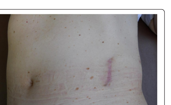
Figure 3 Postoperative appearance.

with reduced renal function possibly brought about by renal ischemia and/or perfusion abnormality [15], recent studies have shown that pneumoperitoneum does not appear to have an adverse impact on early graft reperfusion [16]. In our patient series, graft dysfunction involved in shortcomings of the surgical procedure or pneumoretroperitoneum was absent.