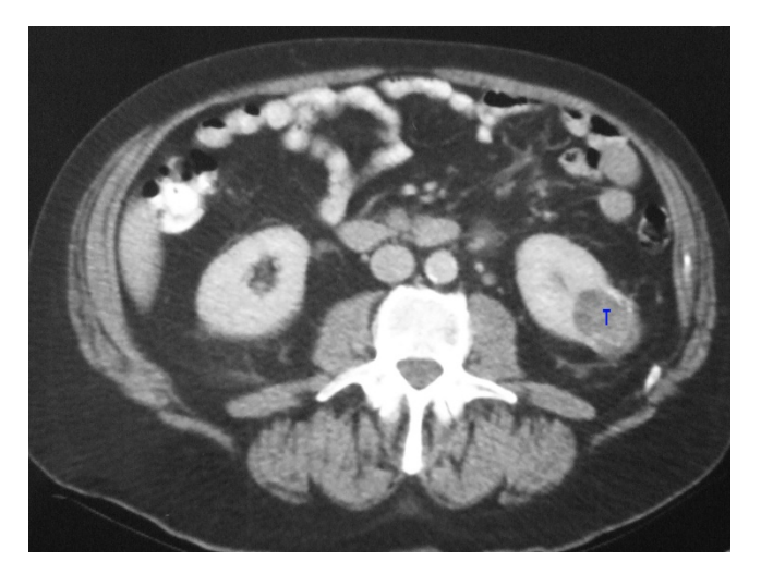
Figure I CT picture of a left lower pole renal tumour (T).

The median tumour size was 70 mm (range 16–175) on CT and 65 mm (range 15–90) on pathological measurement. 22 patients had a CT size \leq 40 mm. CT tended to overestimate the size of tumours in 41 patients, underestimate in 45 and agree with surgical size in 20 patients. Statistically there was no significant difference between the two measurements (p = 0.7, Wilcoxon sign ranked test). When subdivided into tumours less than 40 mm (p = 0.7) and more than 40 mm (p = 0.09) again there was