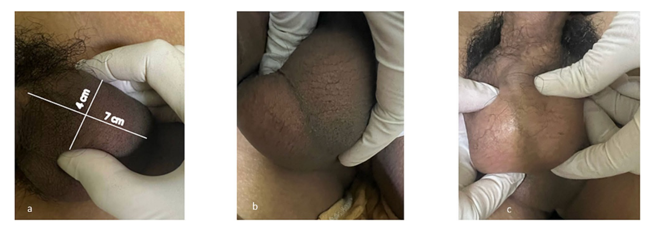
Fig. 4 Left testicle enlargement showed at first visit (a), fourth month of treatment (b), and sixth month of treatment (c)

Imaging modalities commonly used to confirm epididymal TB include US, computed tomography scan