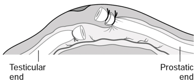
Figure 1 Vasectomy procedure using ligation and excision combined with fascial interposition over the testicular end.

NSV = No Scalpel Vasectomy, FI = Fascial Interposition, V = Vicryl, S = Silk, C = Cotton.