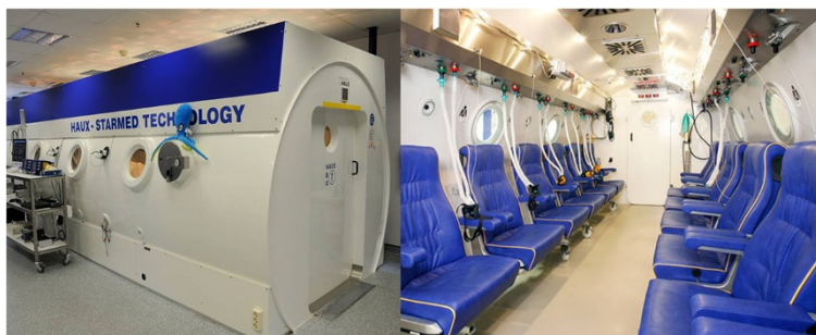
Figure 1 Exterior and interior view on the pressure chamber for max. 12 persons.

ISF) and two patients (13%) were treated with cyclophosphamide for Wegener’s granulomatosis or Lupus erythematosus.