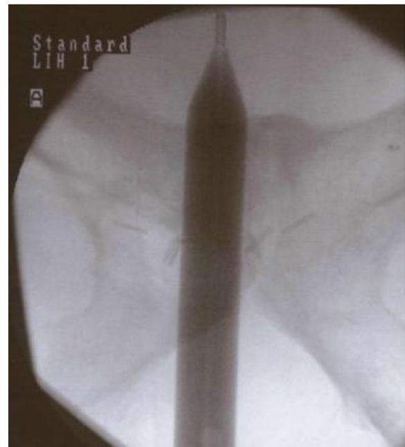
Fig. 2 a Fluoroscopic image demonstrates the concentric deformity in the balloon at the site of the vesicourethral anastomotic stricture. b No deformity is noted in the balloon after dilation with high pressure inflation

Transurethral balloon dilation is an established method of treatment for urethral stricture. The radial application of forces dilates the stricture, while avoiding