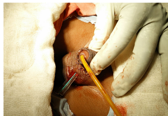
Fig. 3 Replantation complete, with Foley's catheter in situ and corrugated drain

Successful replantation entails the following principles; removal of debris, debridement of necrotic tissue,