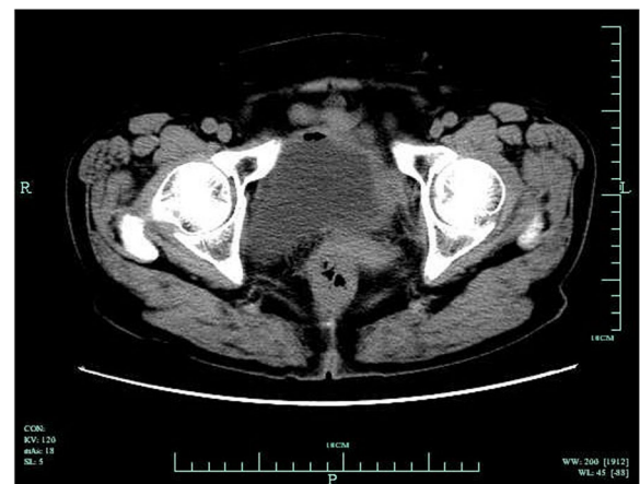
Fig. 2 Computed tomography showing the thickened local left bladder wall and the internal iliac muscle

were normal. The abdomen was flat with no signs of peritonitis. There was a 1 × 1-cm red swollen area at the left suprapubic skin with purulent secretion. Abdominal computed tomography (CT) showed a thickened left bladder wall and internal iliac muscle. No abscess was found in the pelvic cavity (Fig. 2). We diagnosed that the TVT mesh caused a sigmoid colon perforation that led to colocutaneous fistula. An exploratory laparotomy was performed through an incision in the midline of the lower abdomen. The TVT tape was found to have perforated the sigmoid bowel in an in-and-out fashion before exiting at the suprapubic skin incision. The sigmoid colon was fixed to the abdominal wall by the tape. After the two sides of the tape were mobilized and cut, an 8 cm-long whole left part of the mesh was entirely removed from the sigmoid colon and the retropubic space