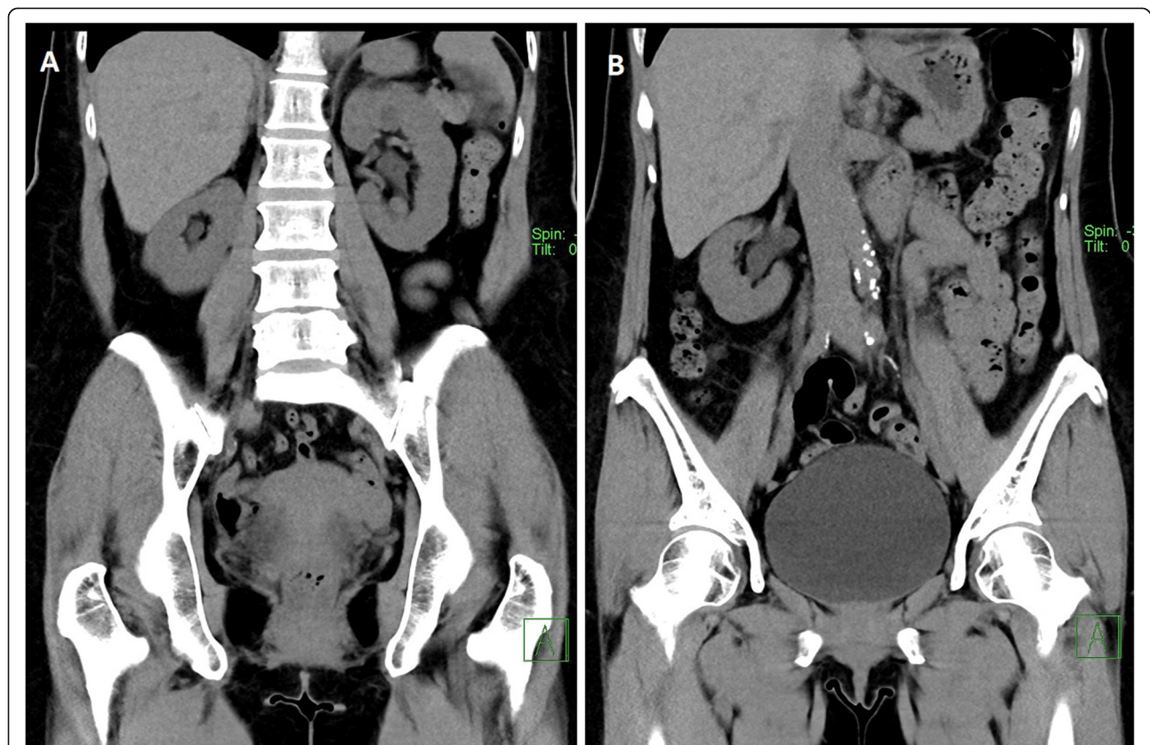
Fig. 1 Non-contrast phase of the CT urogram showing no hydronephrosis or hydroureter bilaterally (a), and a well-distended urinary bladder (b). No ureteric or bladder calculus was seen

On the excretory phase performed at 6 min 13 s post-contrast, peripelvic contrast extravasation was observed bilaterally - suggestive of acute rupture (Fig. 2). No other site of urinoma was observed. A further delayed phase was performed at 50 min post-contrast to evaluate the