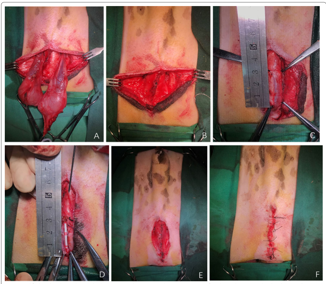
Fig. 3 Modified urethroplasty A longitudinal incision over the penoscrotal junction segment of urethra. B The testes isolated and removed. C A segment of urethra with pre-set length was exposed and dissected. D Scaffold sutured to the native edges of the urethra. E The scrotum and tunica vaginalis removed. F The incision closed in layers with interrupted sutures

tests were used for categorical variables. P < 0.05 considered as statistically significant.