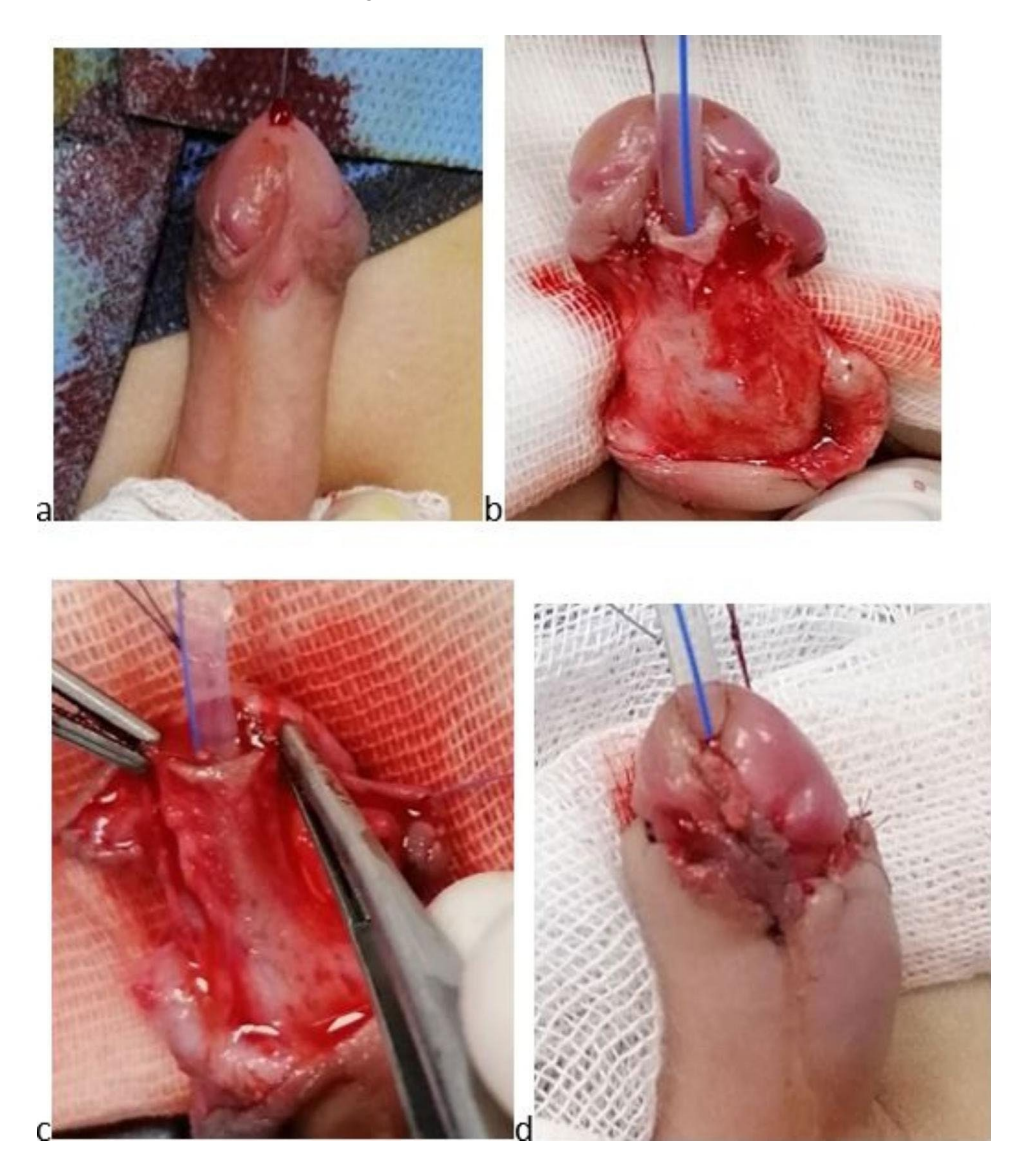
Fig. 2 Modified MAGPI: (a) before operation, (b) after degloving, (c) development of glans wings and urethral mobilization, and (d) final appearance after glans and skin closure

Follow-up was done for all cases in the outpatient clinic at 3 days, 7 days, 3 weeks, and 2 months postoperatively to detect complications. All complications were recorded