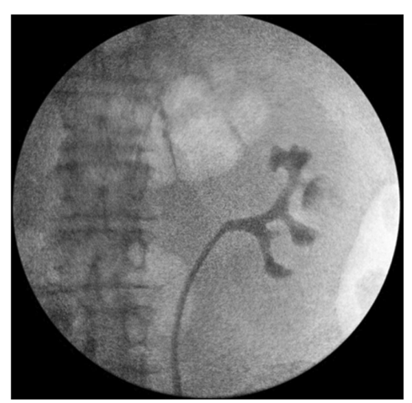
Fig. 2 Retrograde Pyelogram of left sided collecting system

Cryoablation has been validated as a minimally invasive, yet effective treatment for multiple forms of cancer originating from the eye, brain, head, neck, esophagus, liver, lung, and breast [17–21]. In the field of urology, cryoablation is used to treat RCC and prostate cancer. As a therapy, cryoablation induces cell necrosis through either direct ice formation injury or indirect ischemic effects due to microvascular changes [22]. As the extent of tissue ablation is directly correlated to the number and distance between the probes used, cryoablation remains advantageous for patients with comorbidities as it does