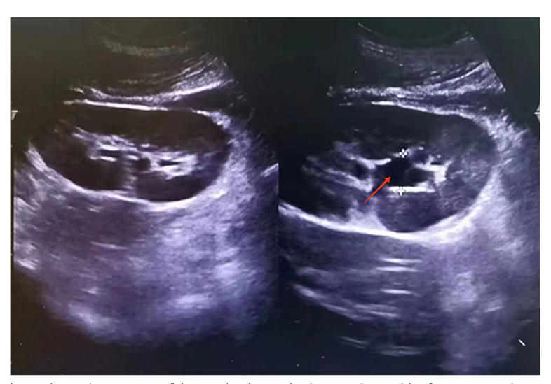
Fig. 1 Ultrasound of both kidneys showed separation of the renal pelvis and calyces with a width of approximately 17 mm at the widest point (red arrow)