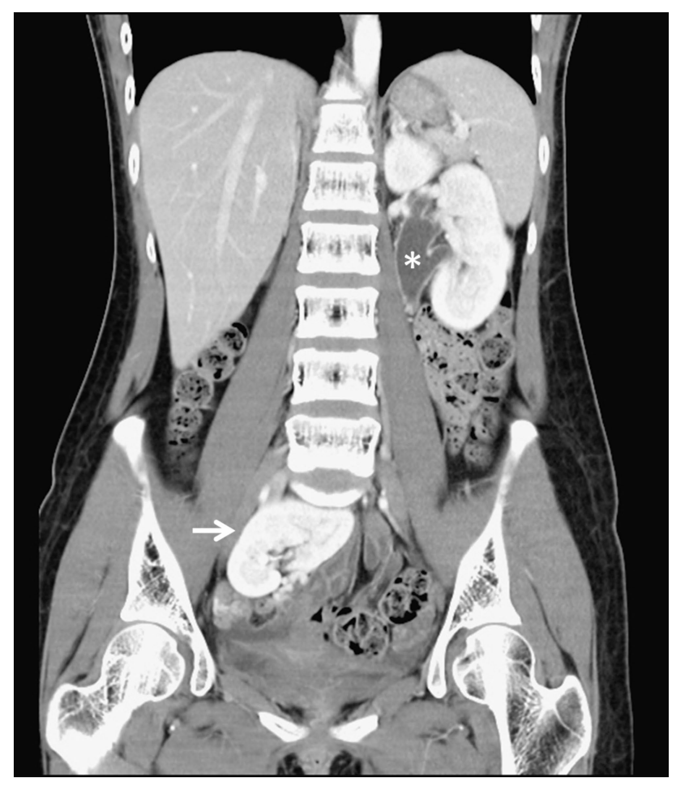
Fig. 1 Abdomen-to-pelvis computed tomography with contrast showing the right ectopic pelvic kidney (arrow) and left dilated renal pelvis (*)

There is no evident increase in the risk of malignant change in ectopic pelvic kidneys [3].