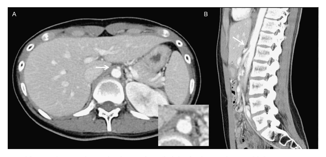
Fig. 2 Abdomen-to-pelvis computed tomography with contrast showing the thickened median arcuate ligament and diaphragmatic crura (A, arrow) and the kinked proximal celiac artery, with a hooked appearance, and post-stenotic dilatation (B, arrow)

reports had focused on the risks of ectopic kidneys in childbirth. Intuitively, anatomic abnormalities may affect the safety of caesarean section. Compared with the rare ectopic kidney, what can be used as a comparison is the risk of childbirth after kidney transplantation. The following complications in pregnant transplant recipients are higher than in the general population in previous reports: stillbirth rate, ectopic pregnancies, preeclampsia, pregnancy-induced hypertension, gestational diabetes, cesarean section delivery, preterm birth and low birth weight [14]. However, apart from the same location of the kidneys (ectopic kidney and graft kidney), there are huge differences between the two in other pathophysiological aspects. Further research is still needed to confirm the relationship.