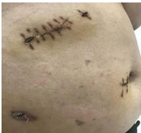
Fig. 2 Positions of the ports. A 10-mm trocar was inserted above the umbilicus, and another 10-mm, 10-mm and 5-mm trocar were placed under the right costal margin, right anterior axillary line and subxiphoid, respectively

A giant PGL/pheochromocytoma usually present with paucity of clinical signs and symptoms [14, 15]. The mechanism of clinically silent PGL/pheochromocytoma remains unclear. The reasons for the same can be due of