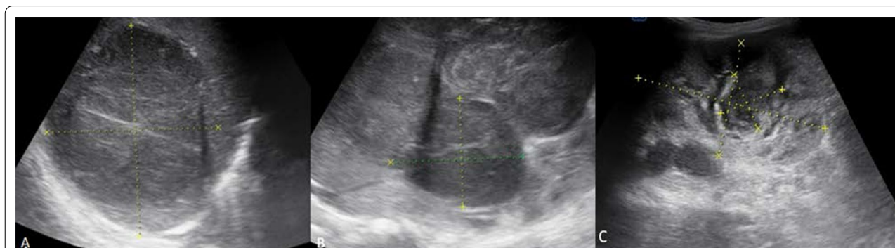
Fig. 1 Ultrasound scan of the abdomen. A Heterogeneously hypoechoic solid mass in the right lobe of the liver in segments V, VI, VII, VIII; B heterogeneous solid mass in the middle to inferior pole of the right kidney; C echo complex mass predominantly solid in the left kidney

Wilms' tumor is a common childhood and commonly presents as a unilateral disease. However, bilateral disease is seen in about 5–8% of the cases and can be synchronous or metachronous [4]. Our patient presented with a synchronous bilateral Wilms' tumor at the time