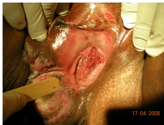
Fig. 2 The vaginal examination revealed a 10 cm opening permitting the urinary bladder wall to prolapse into the vagina

which had resulted in dilatation and pressure necrosis of the urethra with subsequent severe incontinence.