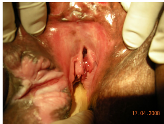
Fig. 1 The vaginal examination revealed destruction of the urethra

A 46-year-old paraplegic woman presented to the outpatient urology department, complaining of recurrent febrile urinary tract infections and severe urinary incontinence for 2 years. She suffered from persistent malodorous urine and skin breakdowns from constant urine leakage. She typically used long-term urethral catheters,