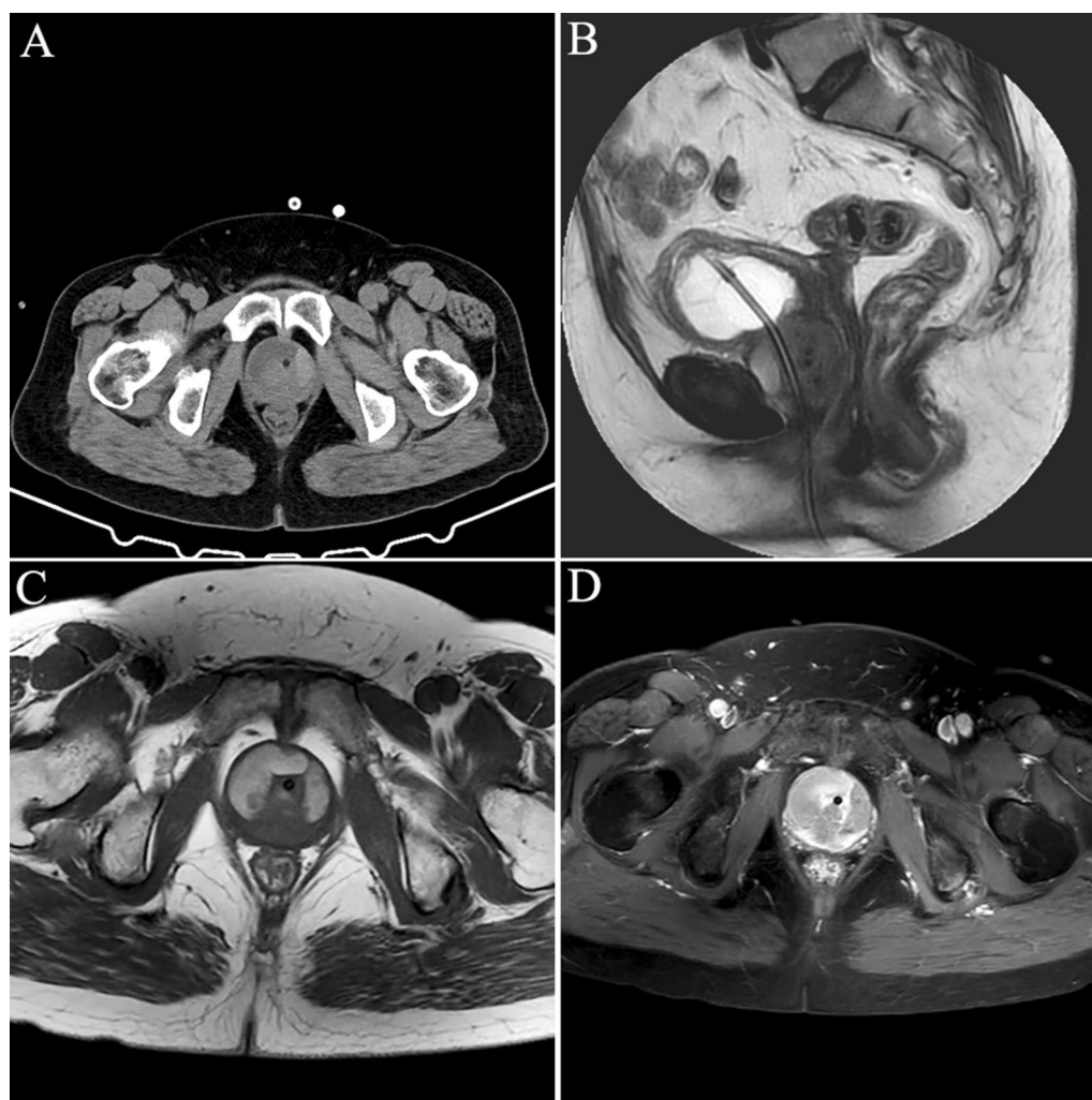
Fig. 1 The CT and MRI features of the periurethral mass. a Pelvic CT scan; b sagittal T2-weighted MRI image; c axial T1-weighted MRI image; d axial T1 image with contrast

Considering the high malignancy of this tumor, radical cystourethrectomy was suggested. But the patient refused the plan and insisted on bladder preservation. The tumor was removed by a simultaneous laparoscopic abdominal and transperineal approach. The mass was firmly adherent to its surrounding tissue and part of the anterior vagina wall was resected. Gross examination of the resected specimen revealed a solid mass ( 5 \times 4 \times 3 cm) with irregular margins (Fig. 2b). The pathological results showed a positive surgical margin and urethra and vagina wall invasion (Fig. 3). Immunohistochemically, neoplastic cells were positive for CK20, CDX-2, CerbB-2, MSH2, MSH6, MLH1, PMS2 and P53. The patient's postoperative course was uneventful. The patient received adjuvant systemic chemotherapy comprising S-1 and oxaliplatin